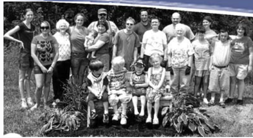
Aktion club, volunteers, family members and friends dedicate bench to lost friend

The mission of Aktion Club is to provide